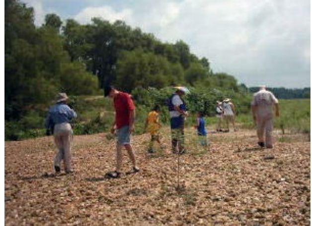
Click on image to enlarge. No, we aren't looking for something ... just stretching our legs

Our Memorial Day trip on the Columbus Loop was probably the biggest one yet, with 62 folks in some in 48 boats. On a slightly overcast, warm day we put in about 10 am at the Columbus Loop of the Colorado River. The river was a little higher than usual, giving some of us a bit of a workout, especially the mud when we disembarked. We were about evenly split between experienced paddlers (aka, old members) and "newbies" (more recent members) so there was some levity when only a senior paddler or two took impromptu "swims" but they insisted that was intentional to cool off from the heat.