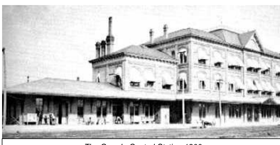
The Grande Central Station 1900

Across the street, to the north, is the One Bayou Park building, still under construction. It is an interesting renovation of the Tennison Hotel. The Tennison Hotel, built in the early 1920's, was a 'railroad station hotel' serving business travelers arriving by train at the nearby Grand Central Station.