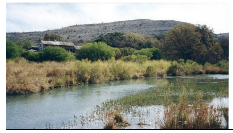
The Devils River Put in at Bakers Crossing

The Highway 163 bridge, or the campground just upstream, is the put-in for the 15 mile trip to the Devils River State Natural Area. It is a long, arduous paddle that must be completed in one day since camping along the river in this section is prohibited by the landowners. Check with the Park to make reservations for camping along the river at the Park.