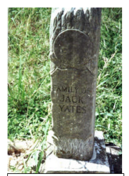
Jack Yates tombstone in College Memorial Park Cemetery

On a bare plot of land on the south east corner of Allen Parkway and Heiner Street, the remains of 430 burials of a 19th century 'pest' cemetery, located in the northwest corner of Allen Parkway Village, were re-interred in the Heiner Street Memorial. Two pestilence hospitals provided care to freed slaves and indigent whites from 1879 to 1908 and many of those who