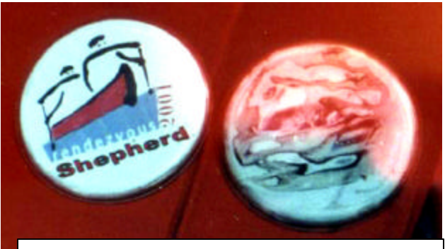
Shepherd tags before and after the rain on Saturday

However, in spite of the ominous NUMBER THIRTEEN – people came, boats were paddled, a sense of excited prevailed, my volunteers showed up and helped, and that number of doom didn't win.