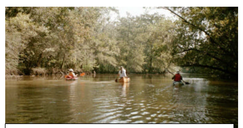
the group on the main body of the Cutoff, which flows between the Old and Lost Rivers in the Trinity river basin

single shot heard, despite previous warnings. You can see sizable cypress trees from any point on the river, there are many willows and lots of hardwoods and understory trees. I was surprised to see many cardinal flowers (lobelia cardinalis) and swamp lilies (crinum americanum) in bloom. Those bright red cardinal flowers do seem to like woodlands by streams, but the swamp lilies I thought had required more direct light, and I had thought they were spring bloomers but no complaints on their last-of-September showing!