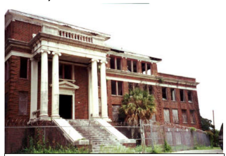
The original Jefferson Davis Hospital, built in 1926 on the site of the second City Cemetery.

Frostown, Houston's original suburb of the 1850's, had a cemetery located on blocks A and H of the subdivision that fronted on Buffalo Bayou. The cemetery was used until the 1880's, but, according to the Harris County tax assessor's block books, the cemetery has disappeared into the bayou.