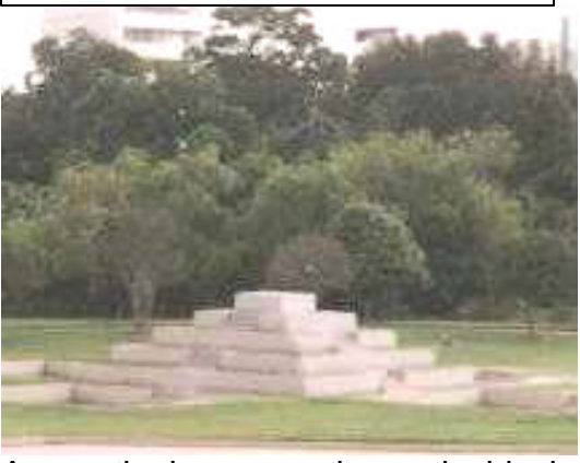
Police Officers' Memorial

Across the bayou, on the north side, is Glenwood Cemetery. Established as a cemetery park in 1871 on the site of a former brickyard, many of Houston's rich and famous are buried there, including former governor Ross Sterling, former mayor Roy Hofheinz and billionaire Howard Hughes.