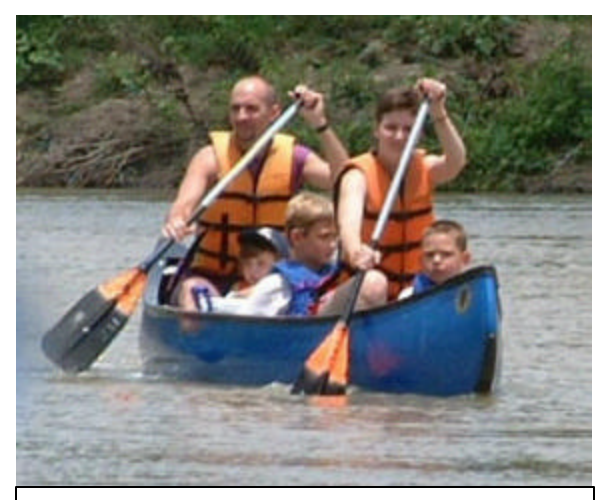
Family enjoying a relaxing paddle on Columbus River

trailing behind: a nice Memorial Day family outing.