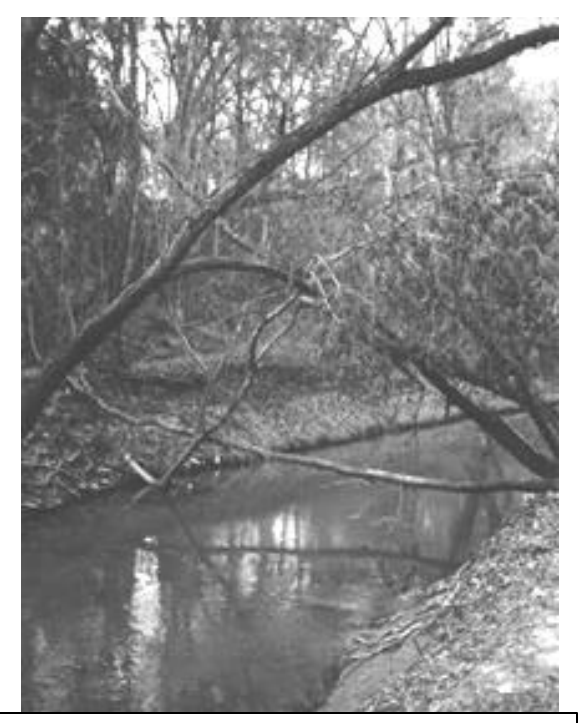
Buffalo Bayou at about 900 cfs (high water) near Memorial Mews. Thischannelized section of the Bayou has a unnaturally narrow stream bed with overhanging trees, fallen limbs, limited eddy pullouts, and other hazards.

The launch site on Memorial Mews is located on the spillway channel from Addicks Reservoir along the former course of South Mayde Creek. Within 100 yards, the channel joins Buffalo Bayou in a section that was channelized as a part of the flood control program that was completed in 1946. Below Barker Dam, the bayou was straightened from Highway 6 to Wilcrest Road.