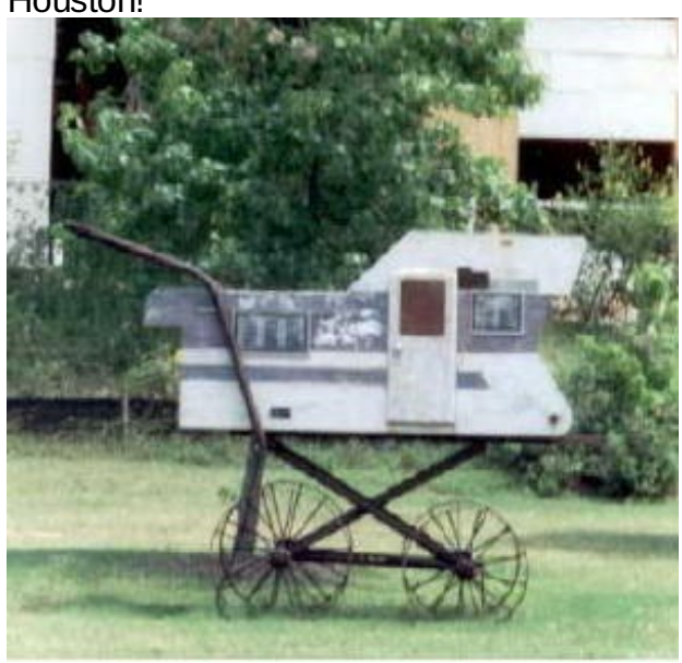
Does this Winnebago stroller tell us something? Click on image to enlarge.

For those of you who have never experienced the random art and sculpture along the bayou, you're in for an unexpected treat. Located at 500 Allen Parkway and at several other locations along the bayou, the Buffalo Bayou Artpark showcases installations from artists across the country. The Artpark attempts to merge nature and art, placing significant pieces on the edge of the Bayou, right smack dab in the middle of hectic Houston!