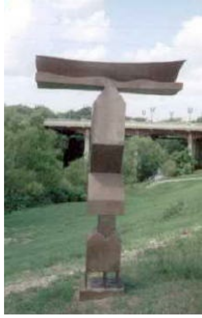
Your guess is as good as mine. Is it a safety razor?

Right now paddlers, cyclists and walkers are in for a real treat. According to a recent blurb in the Houston Chronicle the Buffalo Bayou Artpark is hosting a "Watermelon Flats Reunion Show" through Spring 2003. The main area of sculptures will be at the Sabine Street Bridge, but the art and sculptures extend along both sides of the Bayou.