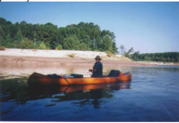
Solo on the Sabine Click on image to enlarge.

Paddling on the Sabine Click on image to enlarge.