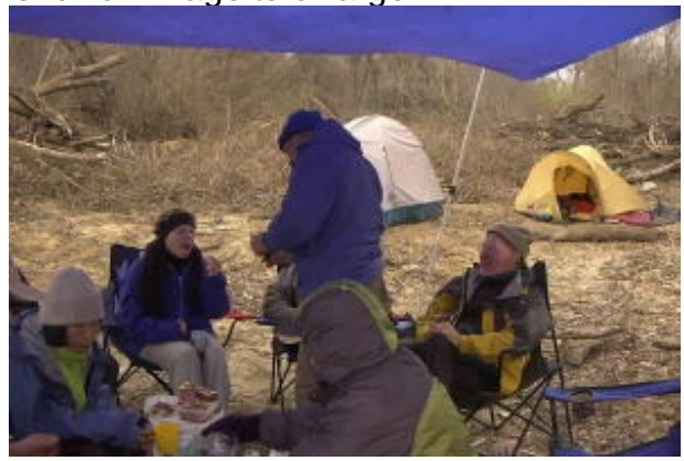
More food Click on image to enlarge.