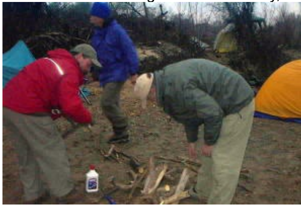
You just rub two sticks... Click on image to enlarge.

From there, the story differs, depending on who is telling it. One person left the others and went to the park. The others waited on the highway. Lost one returned to the highway but the others had gone to Walmart (assuming all women love to shop??). We had cell phones but no numbers to call. We had 2-way radios - in the wrong cars. We all went in circles looking until dusk. Finally, we all went back to the bridge.