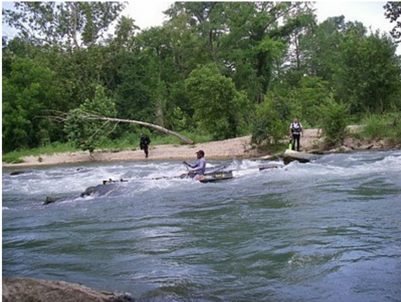
Racer, solo, OC1.

Notice safety personnel on the rock and beach.