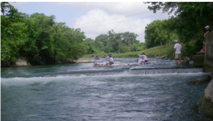
Racers running Cottonseed down the middle.

The Kevlar and glass boats are lightweight but crashing into rocks can be hazardous to the integrity of the hull.