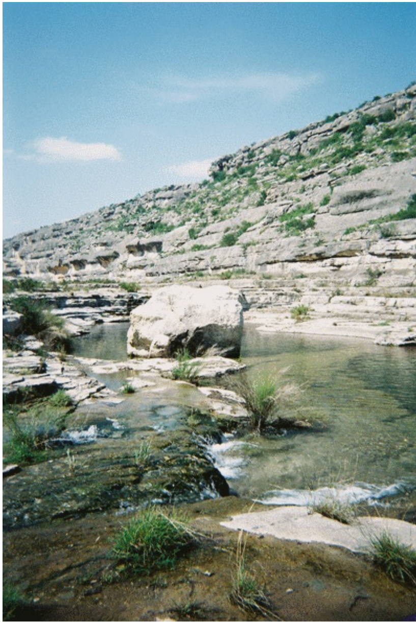
(cool pools to bathe in )

I went fishing with a cheap rod and reel I bought. The reel broke, so Jack showed me how to fish using a bottle to hold the line and using a thumb to release the line.