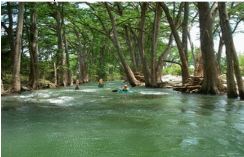
(the Medina River with its beautiful tree canopy)

The hill country is my favorite place to paddle. Here the creeks and rivers are clear, the rapids fun, and each turn offers a new adventure. Of course, some rivers I like better than others, and my favorite is the Medina River. This is a small, twisty river with a tree canopy that expands across the river creating a water tunnel, like a lover's lane.