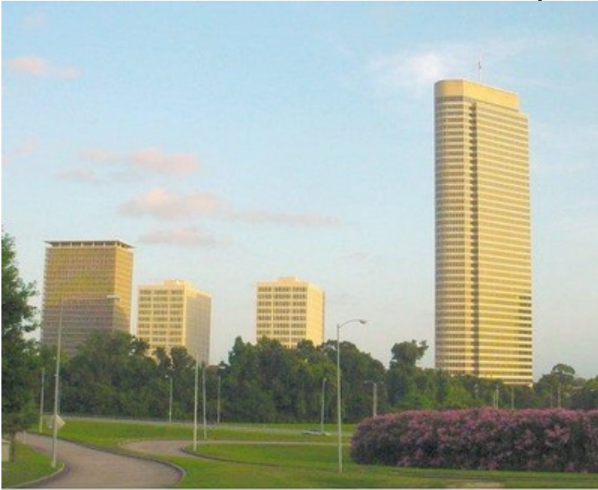
The American General Center on Allen Parkway.