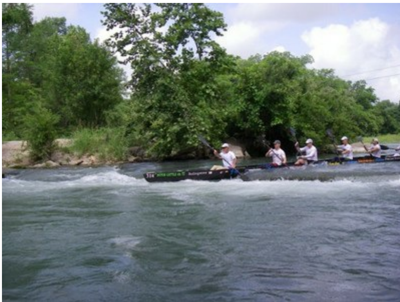
Racers lining up with the V at Cottonseed.

Notice safety personnel on the rock and beach.