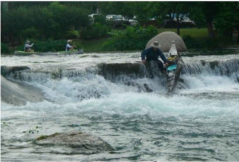
Racer running down the middle of Rio Vista Rapid.