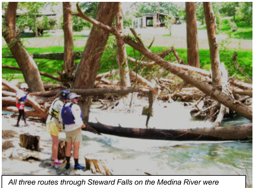
All three routes through Stewart Falls on the Medina River were

On Saturday we were joined by 5 other solo canoeists for a run on the stretch we typically do from Camp Bandina Road to the Tarpley roadside park on FM 470. This is 7.8 miles. In this section there were generally fewer obstructions than in the upper stretch, and perhaps more rapids and fewer long pools. However, again good scouting and careful maneuvering was necessary. At Stewart Falls, trees were down everywhere in the river; most portaged left, two right. There were several good surfing spots on both days.