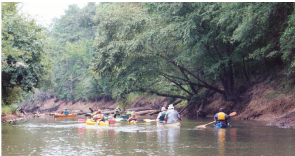
A Peaceful Paddle on the Neches River

After a couple of hours we stopped for lunch on sand bar under a shade tree. Everyone ate their lunch and then had a refreshing swim to cool off. Then it was time to head down the river again. Most of us could have stayed and swam all afternoon but we still had many miles to paddle. The river was gradually getting a little wider and there were a few less logjams.