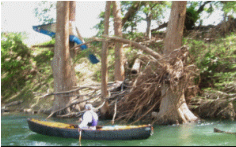
Chet Tigard views debris and canoe in the trees

Six HCC members (5 solo canoes, 1 C-1) ventured to the Medina River on Friday, July 26, the first HCC paddle since the Hill Country flood in early July. On our way to the river we noticed a FEMA Disaster Assistance Center in Bandera. Leaving Bandera on Hwy. 16 the flood effects were more apparent. The highway at two bridges west of Bandera had suffered erosion from the flood and had temporary repairs. Flood debris was piled up along the road and in the fields. From the high water marks it was evident that in places the entire valley had been inundated. The most noticeable change in the river that we could see from the road was large gravel banks along the river, some 100+ feet wide where all vegetation had been washed away.