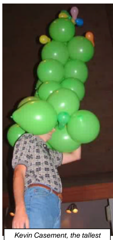
Xmas tree of the group

satiated palates. No one left hungry! A Santa-driven canoe housed the beer and soft drinks to quench our thirst.